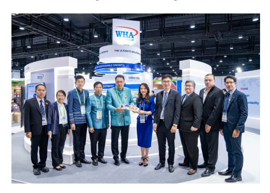
In the picture: WHA Group booth at the APEC Summit demonstrates the company's alignment with BCG goals through green and sustainable projects and investments

As Thailand's leader in fully integrated logistics, industrial estates, utilities and power, digital platform, and one of the APEC 2022 Communication Partners, WHA Group reaffirmed its commitment to help promote sustainable growth through responsible business practices and create value for business, society and the environment through the Bio-Circular-Green (BCG) economic model.