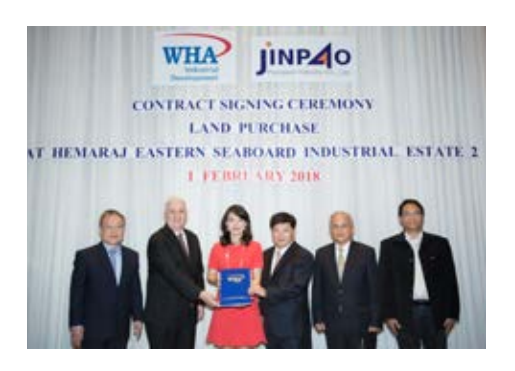
(Continued from page 1)

This new land acquisition at HESIE 2 will enable Jinpao Precision Industry to build a new plant to serve mainly the aerospace industry, producing mechanical parts for industry leaders such as Airbus, Boeing, Falcon Aerospace and Gulfstream. It will be the company's third facility in Thailand, in addition to existing plants in Bangpoo Industrial Estate, and their first one at Hemaraj ESIE 2. Thanks to HESIE 2's strategic location, the future plant will enhance Jinpao's capacity to better answer the needs of its customers in Asia, Europe, North and Latin America.